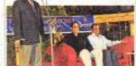
સાંજના સમયે આજના કાર્યક્રમને અંતર્યામી સુભિચારથી સંબોધીને આજનાં સંબોધક હતા.