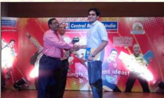
SMPIC STUDENT WINNING DEBATE COMPETITION ORGANISED BY CENTRAL BANK OF INDIA