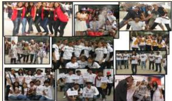
STUDENTS CELEBRATING VARIOUS DAYS DURING INDRADHANUSH