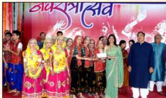
SMPIC WINNING THE FIRST PRIZE AT SPORTS CLUB GARBA COMPETITION