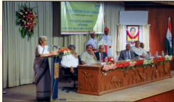
HER EXCELLENCY DR. SHRIMATI KAMLA, THE GOVERNOR OF GUJARAT AT SMPIC