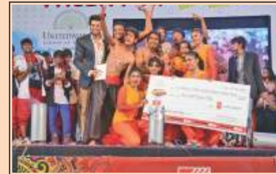
1 st Prize of Rs. 1,50,000 at AM Talent Hunt