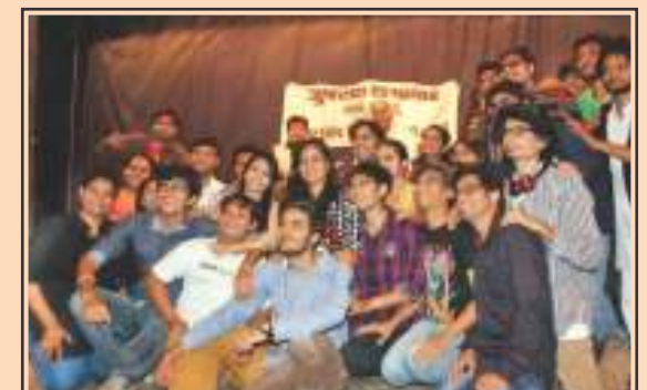
SMPIC DRAMA Team winning at GUJ Samachar- INT Competition