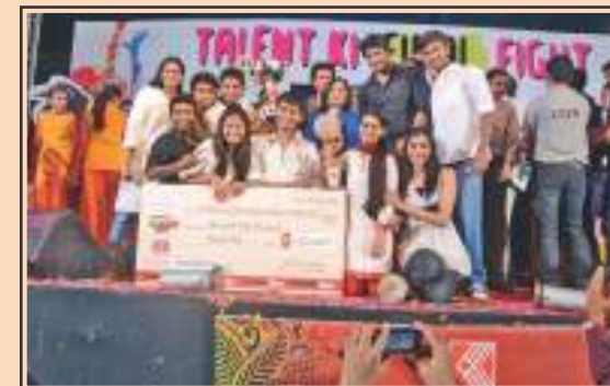
2 nd Prize of Rs. 1,00,000 at AM Talent Hunt