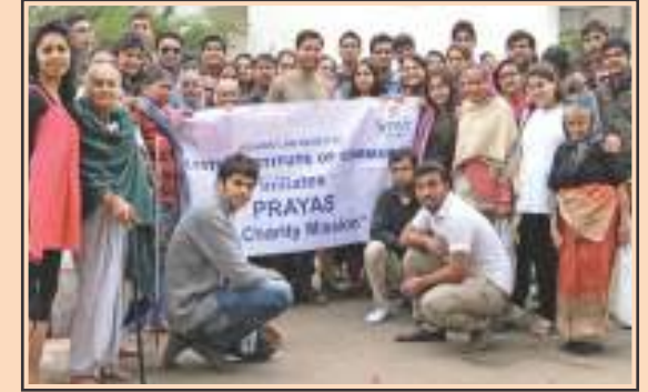
Bringing Happiness at Old Age Home