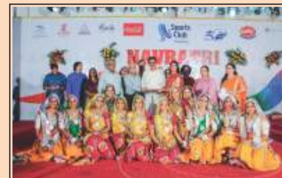
1 st Prize at Sports Club Garba Competition