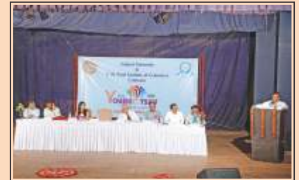
YOUNGOTSAV- SMPIC Hosted the Inter Zonal Youth Festival